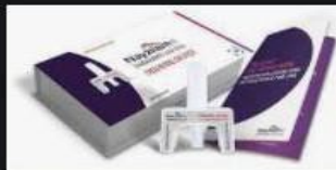
Important Update on NAYZILAM... cureepilepsy.org