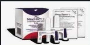
Patient Brochure | NAYZILAM® (... nayzilam.com