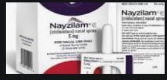
...ilam Nasal Spray: دليل الأدوية العربي... ma7bajo.blogspot.com